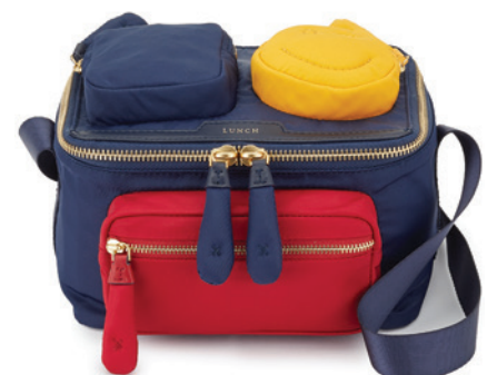
Anya Hindmarch Chubby Pocket Lunch Box, $495; anyahindmarch.com .