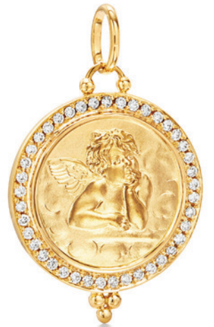
Temple St. Clair angel pendant 18K 21mm with diamond pave, $5,400; Shreve & Co., 150 Post St., 415-421-2600.