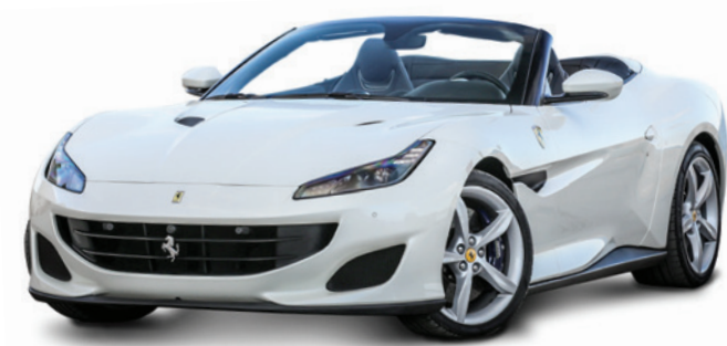
Ferrari Portofino, starting at $214,533; Ferrari of San Francisco, 595 Redwood Highway, Mill Valley, 415-380-9700.