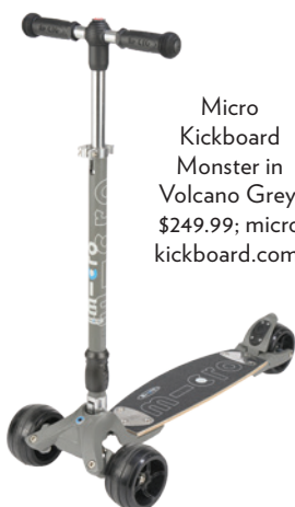
Micro Kickboard Monster in Volcano Grey, $249.99; microkickboard.com .

Clever, fun and stylish gifts for children of all ages.