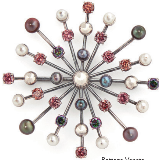
Bottega Veneta Snowflake Brooch, $930; Bottega Veneta San Francisco, 124 Geary St., 415-981-1700.