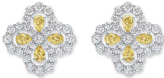
Harry Winston Loop earrings featuring yellow sapphires and diamonds set in platinum, price available on request; Harry Winston San Francisco, 200 Post St., 628-867-1100.

Glam gifts with panache and sophistication — from sparkling treasures to impressive stocking stuffers.