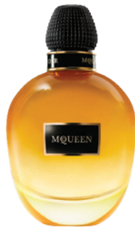
Alexander McQueen Amber Garden Eau de Parfum, $245; Saks Fifth Avenue San Francisco, 384 Post St., 415-986-4300.