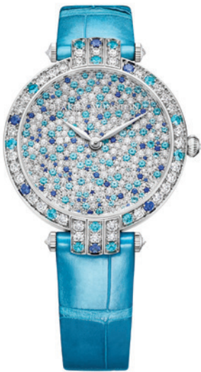
Harry Winston Premier Blooming Snow Automatic Timepiece featuring diamonds, blue sapphires and Paraiba tourmalines set in 18K white gold, price available on request; Harry Winston San Francisco, 200 Post St., 628-867-1100.