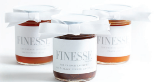
The French Laundry jams, $12 a jar; finessestore.com .