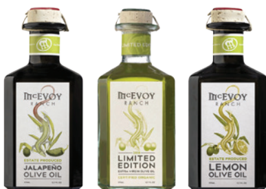
McEvoy Ranch Olive Oil Flight, $90.00; mcevoyranch.com