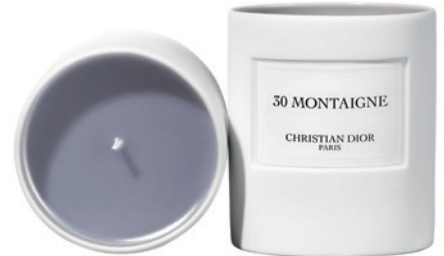
Maison Christian Dior 30 Montaigne candle, $85; Dior Beauty Boutique Westfield Valley Fair, 2855 Stevens Creek Boulevard, San Jose, 408-484-3089.