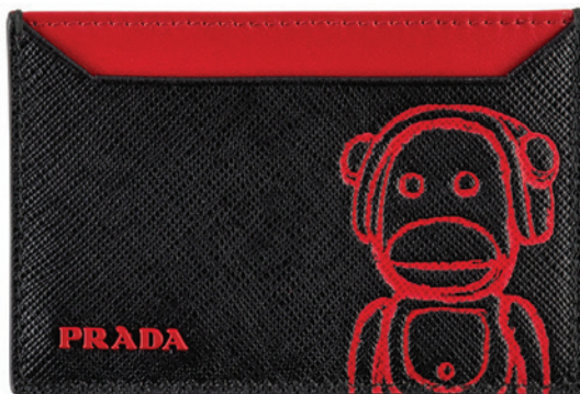
Prada Cardholder, $280; available at select Prada boutiques, prada.com.

Dapper gifts for him top off your wish list with everyday essentials that exude refinement and distinct style.