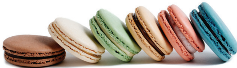
Bouchon Bakery Macaron Gift Box, $65 for a box of 12 large macarons; nationwide shipping through Goldbelly, goldbelly.com/bouchon-bakery .