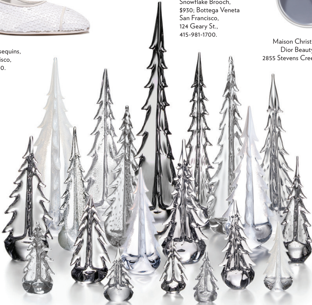
Simon Pearce Enchanted Forest, handmade limited edition set, $5,000; simonpearce.com.