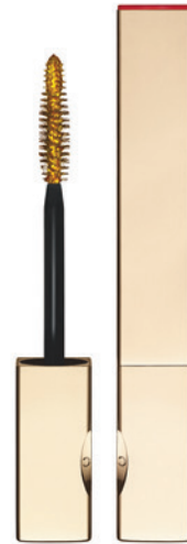
Clarins limited edition Gold Mascara Top Coat, $28; clarins.com.