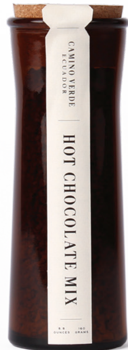
Dandelion Chocolate Hot Chocolate Mix, $18; dandelionchocolate.com .