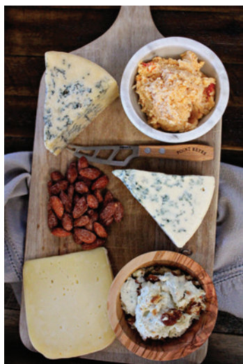
Point Reyes Farmstead Cheese Company's The Fork Collection, $95; pointreyescheese.com .

Extend a piece of Northern California to your far-away and close-by friends. These local, artisanal gourmet companies ship nationwide. Your gift will arrive beautifully packaged and in impeccable condition, guaranteed to satisfy anyone's taste — sweet or savory. And don't forget to treat yourself while ordering.