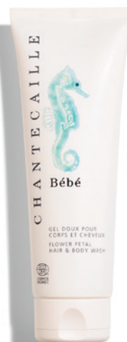
Chantecaille Bébé Collection's Flower Petal Hair & Body Wash (pictured), $49; Wild Moss Rose Body Lotion, $55; Orange Blossom Face Cream, $48; Camellia and Lavender Balm, $42; chantecaille.com .