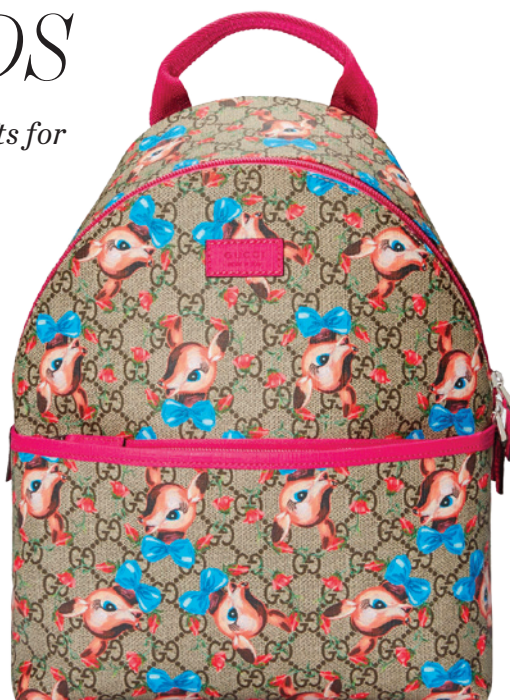
Gucci Children's GG Fawns Backpack, $980; available at select Gucci boutiques, gucci.com .