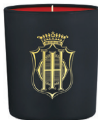
Sisley Paris Orient Candle, $70; sisley-paris.com.