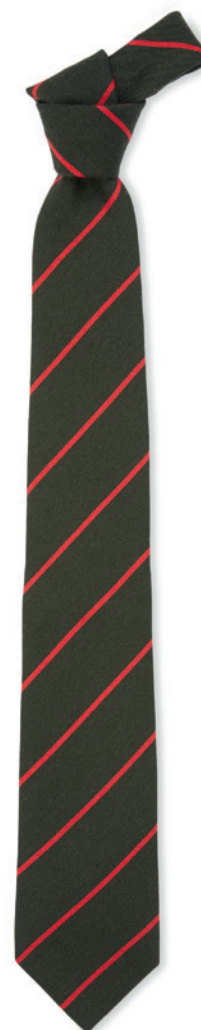
Gucci Striped Silk Tie, $210; available at select Gucci boutiques, gucci.com.