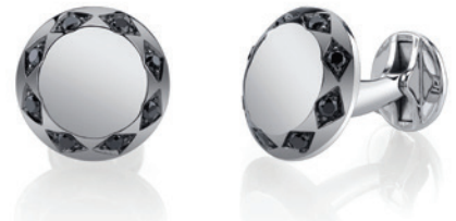
Harry Kotlar Cufflinks featuring black diamonds, $3,205; Shreve & Co., 150 Post St., 415-421-2600.