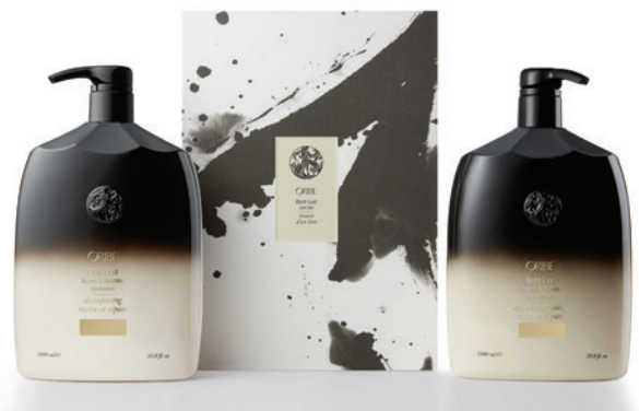
Oribe Gold Lust Liter Set, $285; oribe.com.