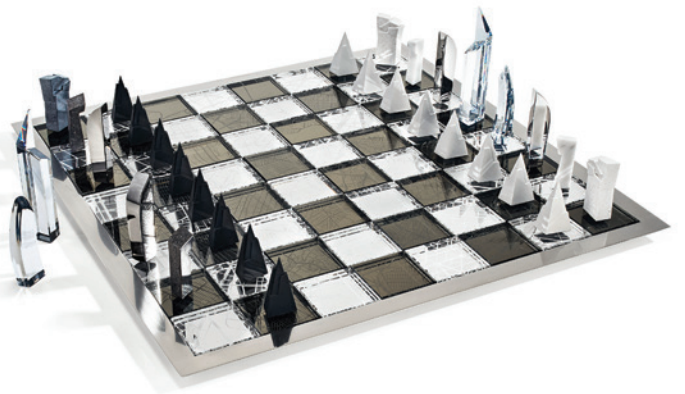
Atelier Swarovski Daniel Libeskind Monochrome Architecture & The City Chess Set, $18,000; atelierswarovski.com.