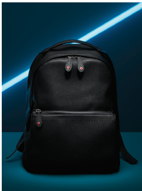
Kiton Backpack in black deerskin, $2,800; Kiton San Francisco, 207 Grant St., 415-989-7000.