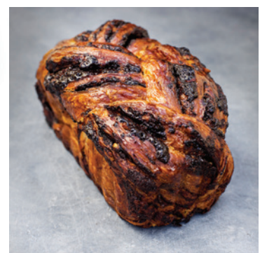
Manresa Bread Chocolate Walnut Babka, $45 for a box of two; manresabread.com .