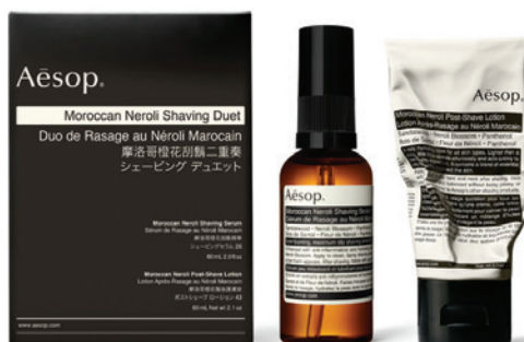
Aesop Moroccan Neroli Shaving Duet, $85; Aesop San Francisco, 2450 Fillmore St., 415-775-1837.