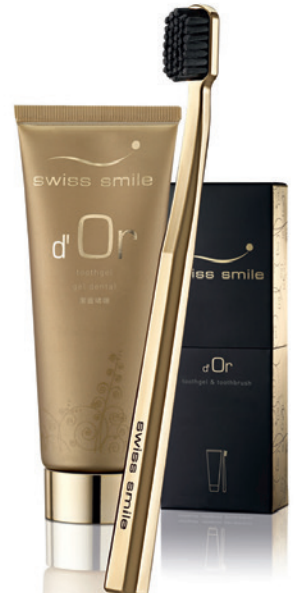
Swiss Smile D'Or Toothgel and Toothbrush gift set, $119; shop.swiss-smile-beauty.us.com (enter voucher code "NobHill" for free shipping).