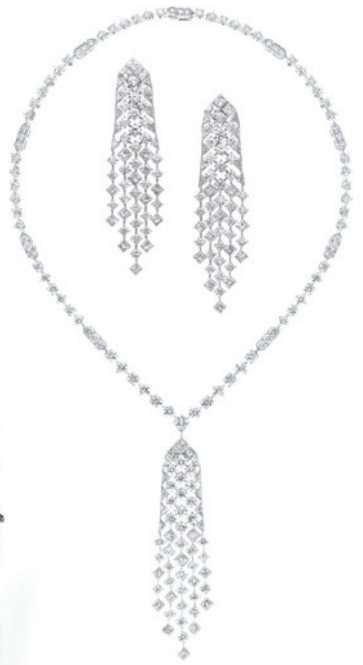
Graff Snowfall diamond necklace and earrings, price available on request; Graff New York, 710 Madison Ave., 212-421-3605.