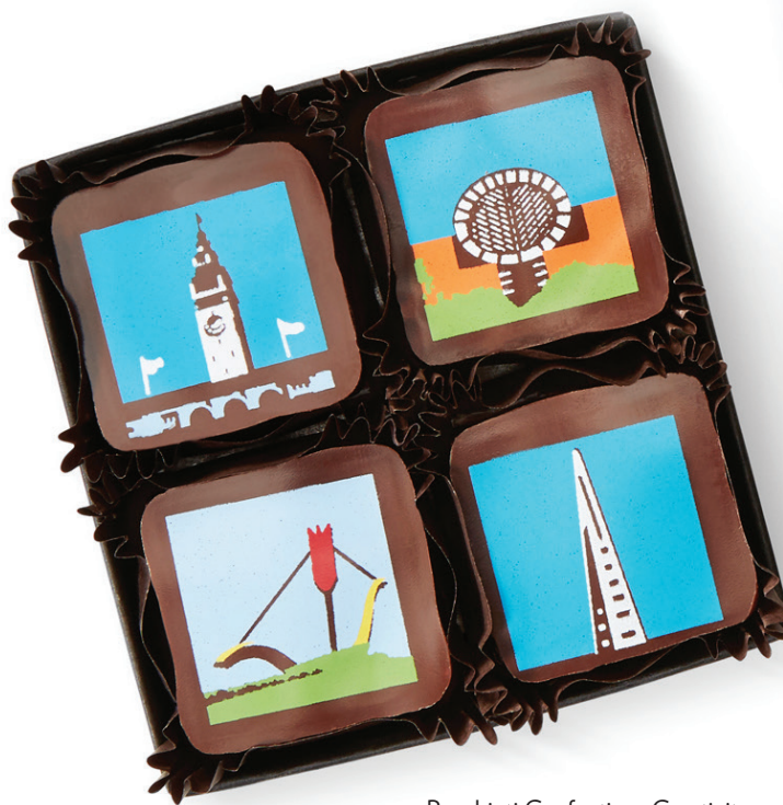
Recchiuti Confections Creativity Explored: San Francisco Icons Boxed Chocolates, $23 for eight pieces; recchiuti.com .