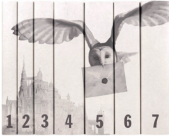
Juniper Books Harry Potter Hogwarts Set, $275; juniperbooks.com.