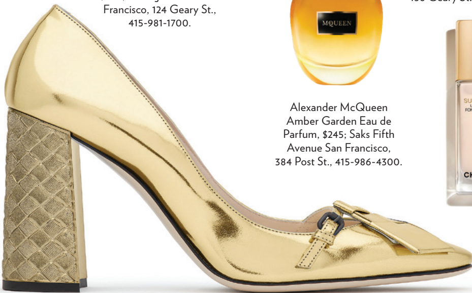
Bottega Veneta Cherbourg Pumps in metallic leather, $790; Bottega Veneta San Francisco, 124 Geary St., 415-981-1700.