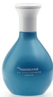
The Harmonist Yin Transformation Parfum, $305; Barneys New York San Francisco, 77 O'Farrell St., 415-268-3500.