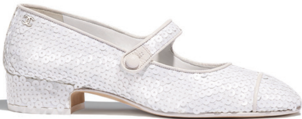
CHANEL Mary Janes in white sequins, $1,150; CHANEL San Francisco, 156 Geary St., 415-981-1550.